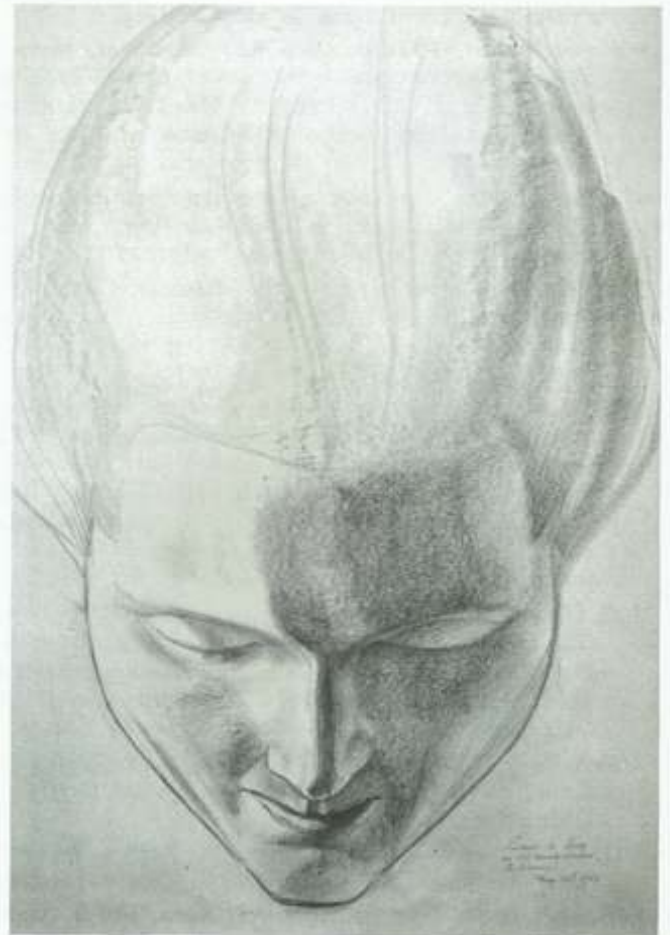
"Sally," a pencil drawing by Rockwell Kent