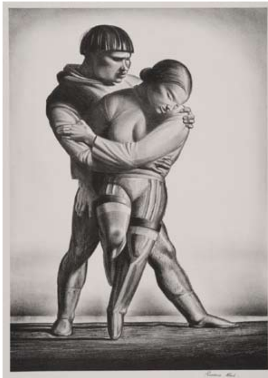
Fig. 16. R. Kent. Greenland Courtship, 1934

shape – a large torso, broad shoulders compared to a narrower figure below the belt (for example, it can also be observed in the work “Greenland