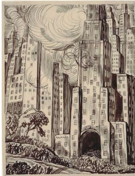
Fig. 1. R. Kent. The Commuters (Urban Landscape), 1923

York, during his studies he periodically published mocking caricatures about a big city life ( Fig. 1 ), which did not seem to him comfortable and suitable for a harmonious life. Together with the university, he also attended painting classes where he met the artist Edward Hopper. Early works by Rockwell Kent with landscapes of New Hampshire and Mount Monadnock were presented at the exhibition of the Society of American Artists in 1904. From 1905 till 1910 he lived on the island Monhegan, Maine – a Northern corner of nature in the United States. In 1918 he went to the next trip to the Northern lands in Alaska together with his 10 year old son, from which he returned in 1919 with a series of paintings, prints and a book titled “Wilderness” that made him a successful artist and writer. In 1922–1923, he travels to Tierra del Fuego, the farthest land of South America, “supplementing”