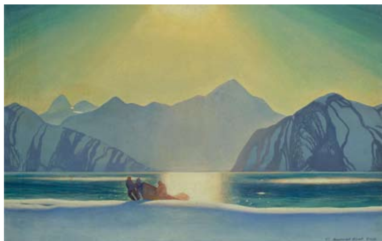
Fig. 8. R. Kent. Sun glare - Alaska, 1919

A representative of this period may be “Sun glare. Alaska” (1919) ( Fig. 8 ). An artistic idea of the work can be described as: lighting/sanctification of the chosen people by sunlight – a divine being with the power of manifestation (emanation) of everything. This idea consists of the fact that the painting is made by layers-levels (sun – sky – mountains – water surface – snow land with three human figures pulling a boat in the centre), the dynamics of colourful strokes from the upper central point to all the rest allows us to determine the character of the “Sun” as the main in the hierarchy of these levels (special significance of directions of colourful strokes and images of the sun is emphasized in another work of the “Whales” series created in 1919 ( Fig. 9 ), where the sun is a source of strength once again, but the movement of light diverges from it radially). Sunlight shows the outlines of the mountains first, then shows the embossed surface of mountains, creates glare on the water surface and, finally, people pulling the boat are coming at the viewer along the “solar path”.