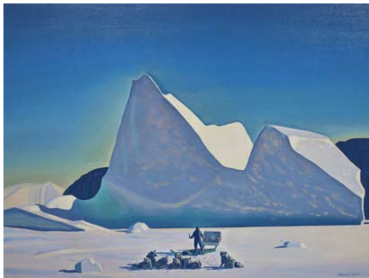
Fig. 5. R. Kent. Artist in Greenland. 1935