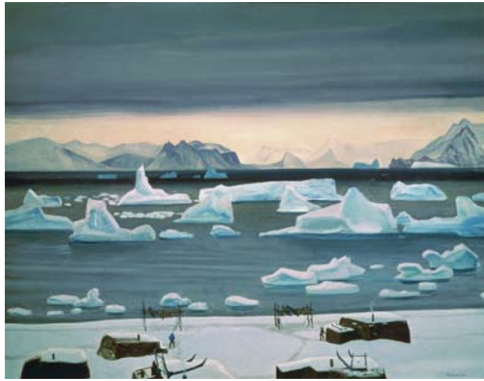
Fig. 13. R. Kent. November in Greenland. 1935 – 1937

soar above everything and look at everything from the universe.