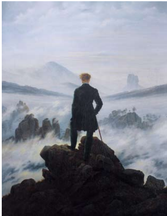
Fig. 4. Caspar David Friedrich. Wanderer above the Sea of Fog. 1818