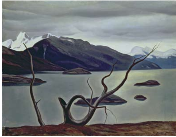
Fig. 10. R. Kent. Admiralty Sound - Tierra del Fuego, 1922-25