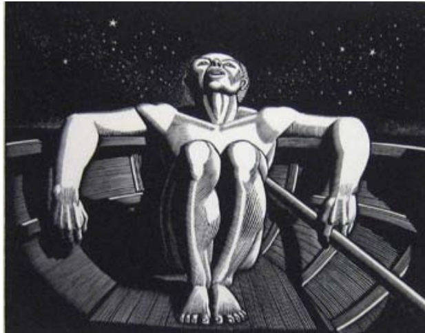
Fig. 3. R. Kent. Drifting. 1933

The central theme of the artwork of R. Kent is a romantic search for a harmonious model of co-existence between a man and nature, visual presentation of the fundamental truths about nature, an image of a human hero capable to “reach” to natural greatness or, at least, able to contemplate this greatness; visual and naturalistic cognition of such phenomena as “pristine wilderness”, “nature in the absence of a human”.