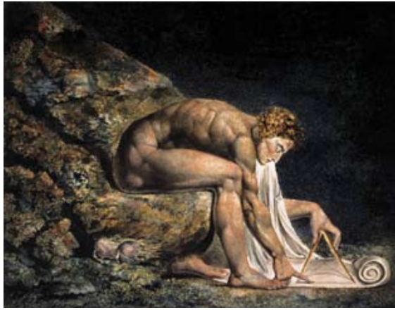
Fig. 2. William Blake. Isaac Newton. 1795