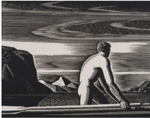
Fig. 15. R. Kent. Greenland Swimmer, 1932