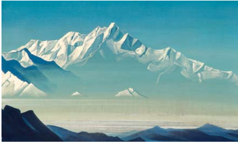
Fig. 6. Nicholas Roerich. Mount of Five Treasures (Two Worlds). 1933