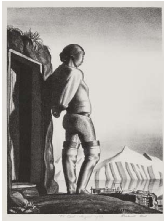
Fig. 14. R. Kent. Young Greenland Woman, 1933

Xylography of “A Greenland swimmer” (1932) ( Fig. 15 ) allows you to clearly see that R. Kent violates the anatomical correctness of the human body image in order to highlight specific differences in a character’s lifestyle – in this case the character has disproportionately large hands, revealing him primarily as a person who specializes in rowing, whose physiology “adjusted” to this type of activity. Similar