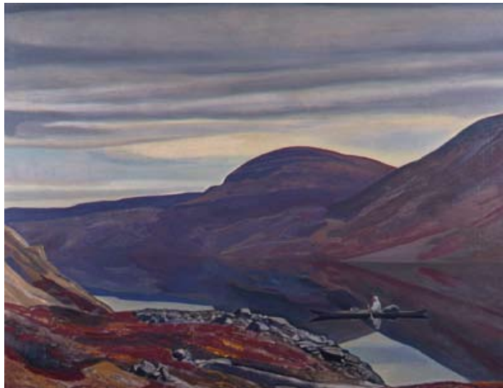
Fig. 12. R. Kent. Dead Calm - North Greenland, 1932

layer from the other are used. Unlike paintings created in Alaska and Tierra del Fuego in this painting there are a lot more people, and dogs also become significant characters. The number of paintings created in Greenland is much more, therefore we can observe changeability of nature throughout the calendar cycle: there is a collection of Greenland landscapes in winter, spring, summer and fall. In the works of this series there are analogies between the Northern paintings and European culture phenomena – for example, comparison of a rock with a gothic style in the painting “Greenland Gothic” (1935-1937) or analogy between a boatman in the painting “Dead Calm” (1932) ( Fig. 12 ) and Charon, etc. In the Greenland series there is also self-reflection of the artist – for example, in the painting “Artist in Greenland” we can observe an artist painting icy massif (or glacier) in the open air, the sacred action of which is guarded by a pack of dogs; if we take into account the fact that R. Kent portrays himself, we may come up with an idea of going beyond your limits, the Northern peace and creativity allow the spirit to