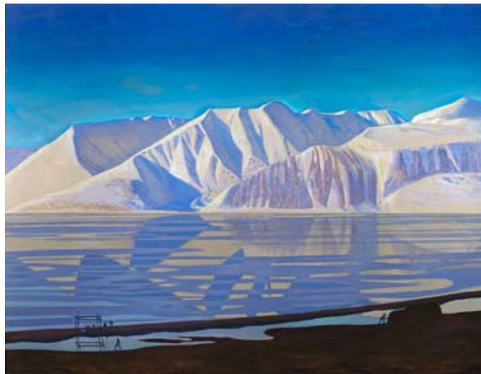
Fig. 7. R. Kent. May, North Greenland, 1935-37

In a situation of occurrence of human figures an active action or event can rarely be noticed, people are often painted in the calm and contemplative states or during everyday activities, which reveals one of the ideas of R. Kent that at some moments in life nothing is happening, but only at such moments a soul can open up to the world;