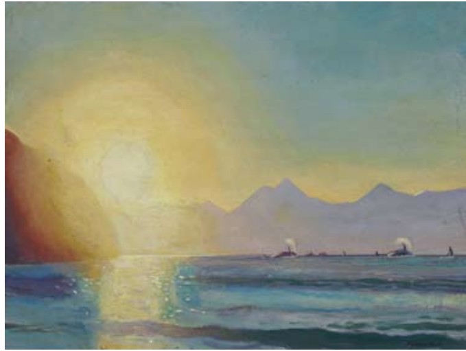
Fig. 9. R. Kent. Killer Whales in Resurrection Bay, Alaska (Whales), 1919

Thus, in a series of works created in Alaska, the concept of “North” is revealed as a place for the chosen people able to understand nature in its primordial purity; North is a place for pagan religious worldview, as in the North it is especially noticeable that nature is an independent creature living by its own laws and rules; North is a clear understanding that everything in the world exists in the hierarchy and a man takes a minor position in this hierarchy.