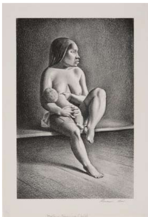
Fig. 17. R. Kent. Greenland Mother Nursing Child, 1934

Just as Paul Gauguin having explored the culture of Tahiti presented the image of a Tahitian woman as Mother, Madonna, Rockwell Kent in his graphic drawings often portrays Greenland mothers with babies: in his drawings the Northern “Madonnas” are presented as vessels full of lifeblood to provide protection for their children from the outside world – for example, in the drawing “Greenland mother feeding a baby” (1934) ( Fig. 17 ) a woman is with exaggeratedly large breasts, with her leg bent obstructing a sleeping baby from the outer space where her meditative look is directed to.